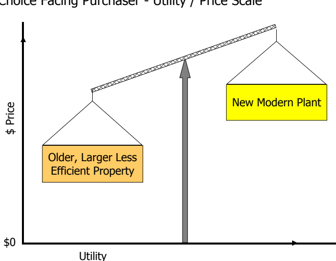
Choice Facing Purchaser - Utility / Price Scale